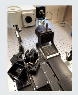
2D-IR setup and Mach-Zehnder interferometer